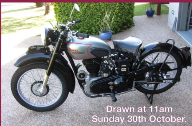
Drawn at 11am Sunday 30th October.

This 1950 350cc Model G Royal Enfield is the giveaway doorprize at the Laidley Swap You must be present with a single armband on and registered at the swap to win.