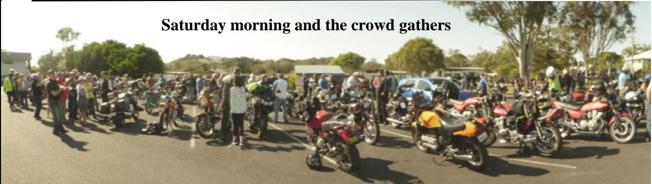
Saturday morning and the crowd gathers

The 2016 NRCMCC annual classic bike rally was held on the weekend of the 16 th to 18 th September. The 3 day event was held at Evans Head and we were joined by the HMCCQ for their "OLD BANGERS TOUR". We had over 100 years of motorcycling on display and had an awesome weekend of classic motorcycling.